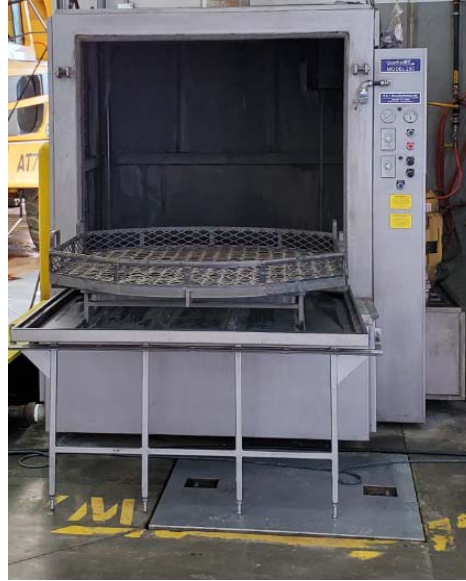
Example: Quadra JET Model 250.