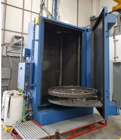
Example: StingRay Parts Washer.