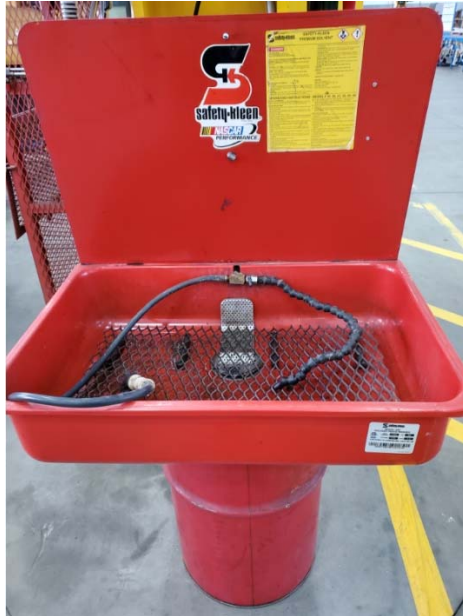
Example: Manual Parts Washer