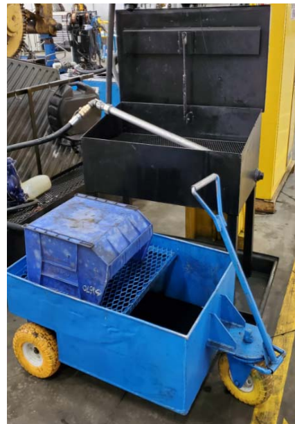
Example: Manual Parts Washer / Oil Cart