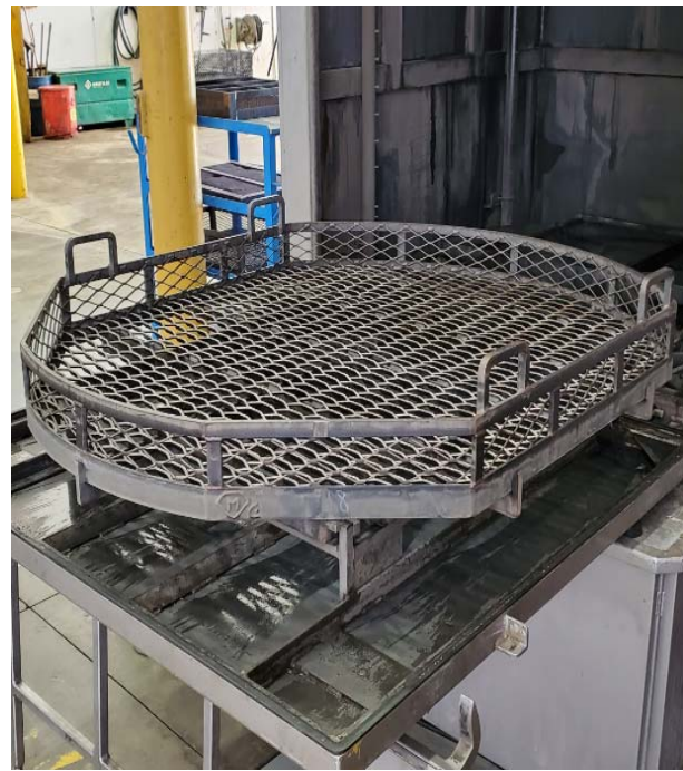
Example: Quadra JET Model 250 – component turntable.