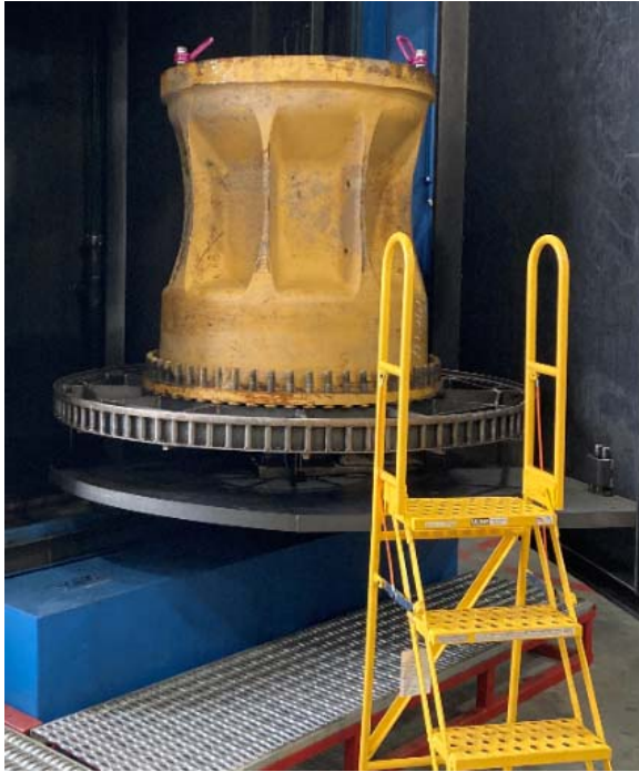
Example: StingRay Parts Washer – component placement center of turntable.