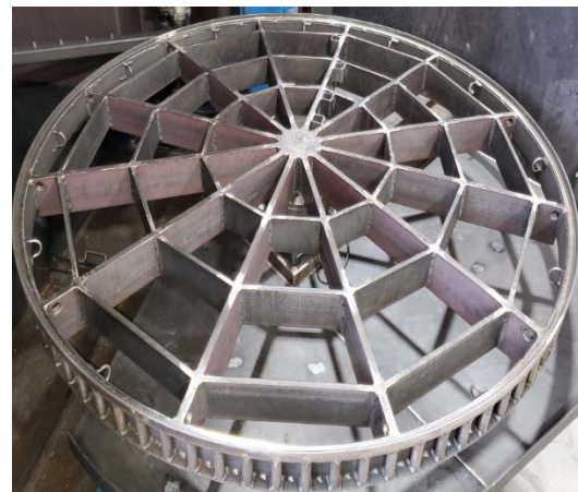
Example: StringRay Turn Table.